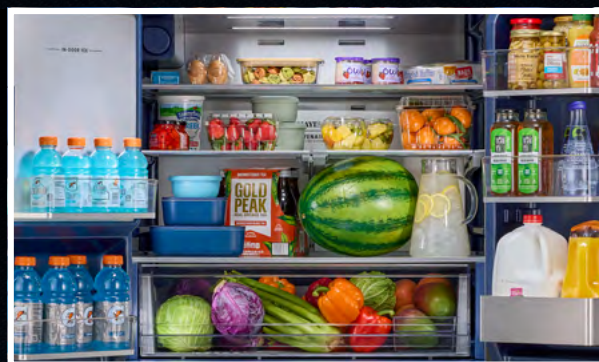
ARCTIC BLUE INTERIOR