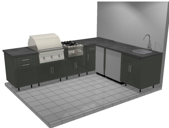
THE ELLANOR (L-Shaped)