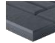
Sedona, Club, Oxford