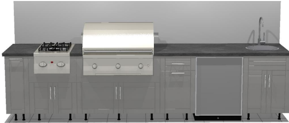
THE ALICE (Linear)