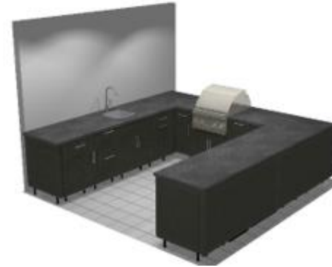
THE AVA (U-Shaped)