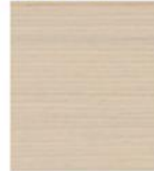
White Oak (While supplies last.)