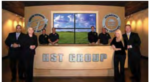
HS Technology Group, No. 29