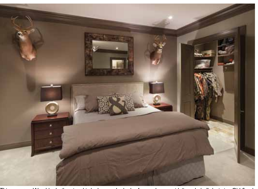
This page, top: Wood-look tiles give this bathroom the look of an outhouse, with "peepholes" depicting Old South scenes painted by Sarah Heringer's cousin, Cheryl Draper. Above: One of two bedrooms features a hunt closet, complete with washer and dryer. Opposite, top: The 13-seat theater looks like the bridge of a space ship. Below: The concession stand in the theater's lobby.