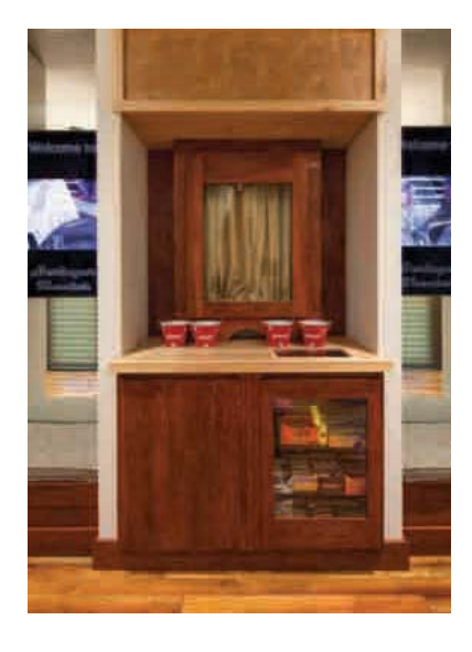
At the entrance to the theater, a snack counter with vertically mounted flat-panel displays on each side.