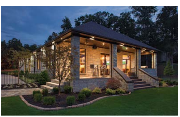
The man cave is a 4,000-square foot freestanding structure next door to Ryan Heringer's house. The patios feature outdoor speakers and TV and motorized mosquito screens integrated into the Crestron system.

include? Heringer's space offers a Crestron lighting system, pre-programmed to set just the right mood for cards, pool, a