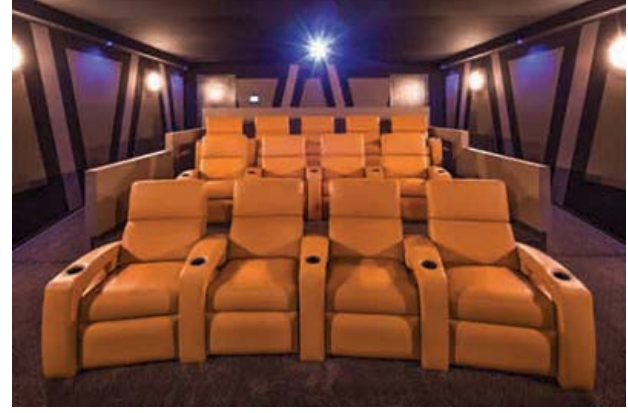
The theater in the man cave features 13 Fortress reclining chairs and eight additional bar stools behind the counter in the back.

The Kaleidescape, set up to serve Bluray movies as well as Heringer's music collection, is actually installed with the other major systems in an equipment room at the main house. Sound Concept technicians installed a fiber-optic link, part of a Crestron DigitalMedia network, to share movies, music, and television sources between the two structures.