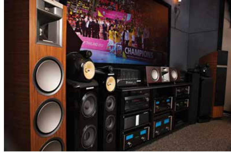
Today, the Sound Concepts showroom includes three theaters with Sony and Epson 4K projectors, Integra 4K receivers, and McIntosh speakers, plus a custom kitchen, integrated bedrooms, a soundproof listening room, a wine cellar, outdoor theater, two corporate conference rooms, a golf and hunting simulator room, three vignette demo rooms, and his and hers luxury bathrooms.

programmers, and technicians to client locations." In addition, he keeps a Chevy Suburban parked at the airports in Little Rock and Fayetteville, where he and his people fly most frequently.