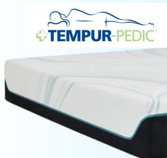
Medium Tight Top Queen Mattress