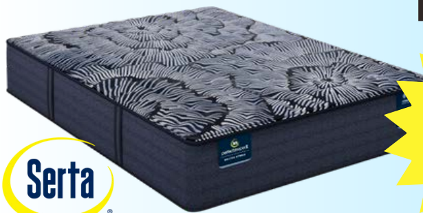
Tight Top Queen Mattress