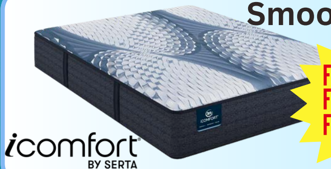
Smooth Top Queen Mattress