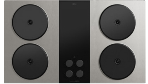
36" coming soon