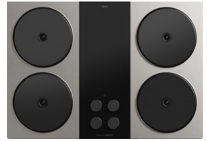
30" available now

From the unmatched power of the HyperCore™ Induction Cooktop to the versatility of Zephyr's indoor/outdoor refrigeration, these products are engineered to elevate the way we live and cook. With a heritage rooted in innovation and craftsmanship, Zephyr continues to shape the future of the modern home—inside and out.